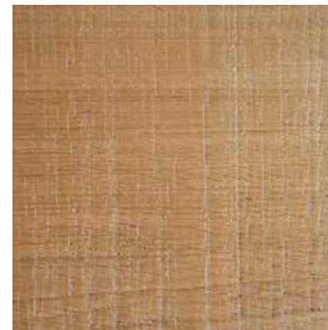
BANDSAWN AND SANDED FACE