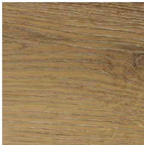
HEAVY WIRE BRUSHED AND BEVELLED