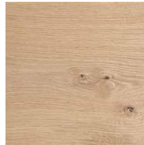
FINE WIRE BRUSHED AND BEVELLED